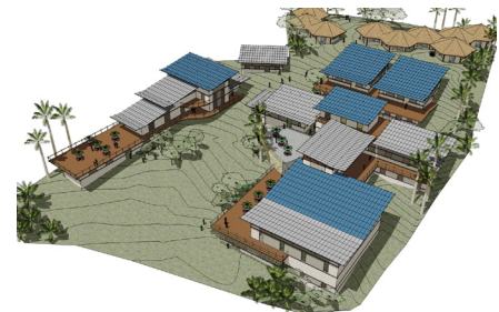
Bill and Joan's design for a new school in rural Haiti rendering by Bill Austin AIA

When we finally arrived at sites, we were struck by how beautiful the surrounding country is. What an opportunity to do something wonderful and so needed. My existential angst is now diminished. We can make a difference here. The process of getting the schools built will be difficult, not the least because we still need to raise the money. But these schools will be solid and safe; and, hopefully along with the natural beauty of the countryside, inspiring and a perfect place to learn.