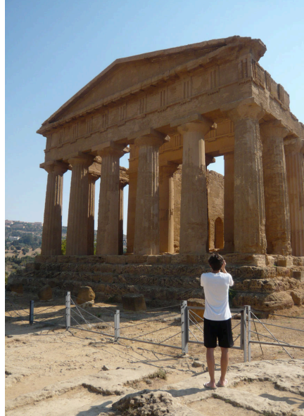
Agrigento Temple in Sicily