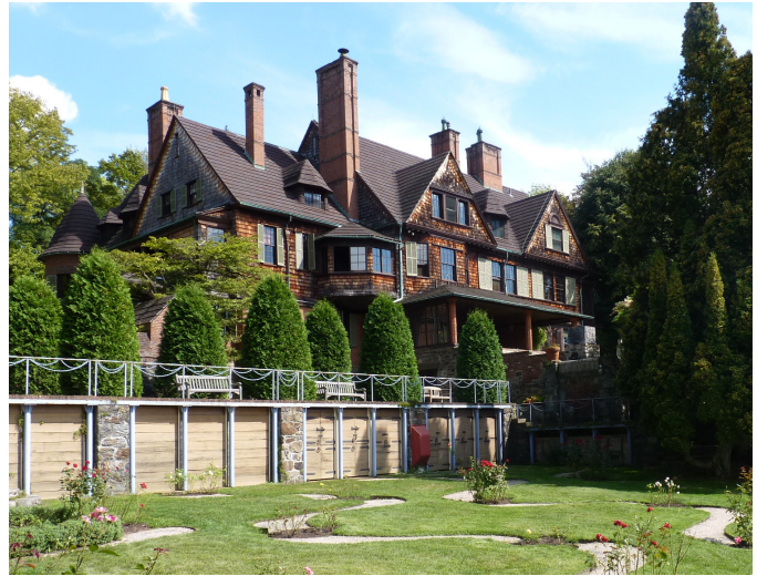
Naumkeag from the rose garden

name for Salem, Mass, where Joseph Choate was born. The name also means “shalom” or peace and welcome. The house and gardens that share the name are indeed welcoming and a pleasant place for a summer afternoon.