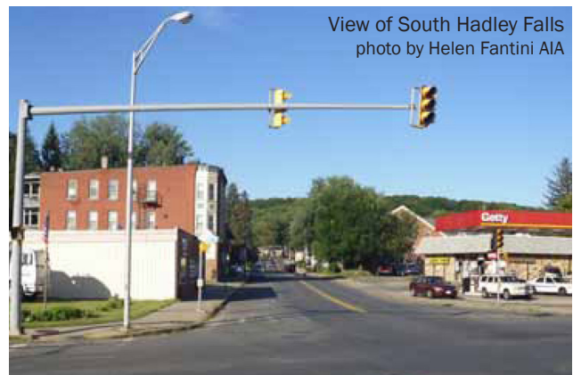
View of South Hadley Falls

We are eager to begin! We are currently working on fundraising, and are awaiting word from the AIA about selection of a SDAT team leader. We have requested that the full SDAT visit occur in mid-to-late April, 2012. A preliminary visit by AIA representatives is expected in February or March. Through conversations with other WMAIA members who have participated in an SDAT, we have learned that they are most successful when a broad range of constituencies are represented; we need to have the right people at the table for these important conversations. In particular, we are very interested in involving this architecture community to maximize the success of this great program. I welcome any interested parties to contact me via e-mail: hfantini@hotmail.com .