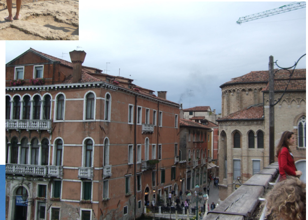
From a bridge in Florence