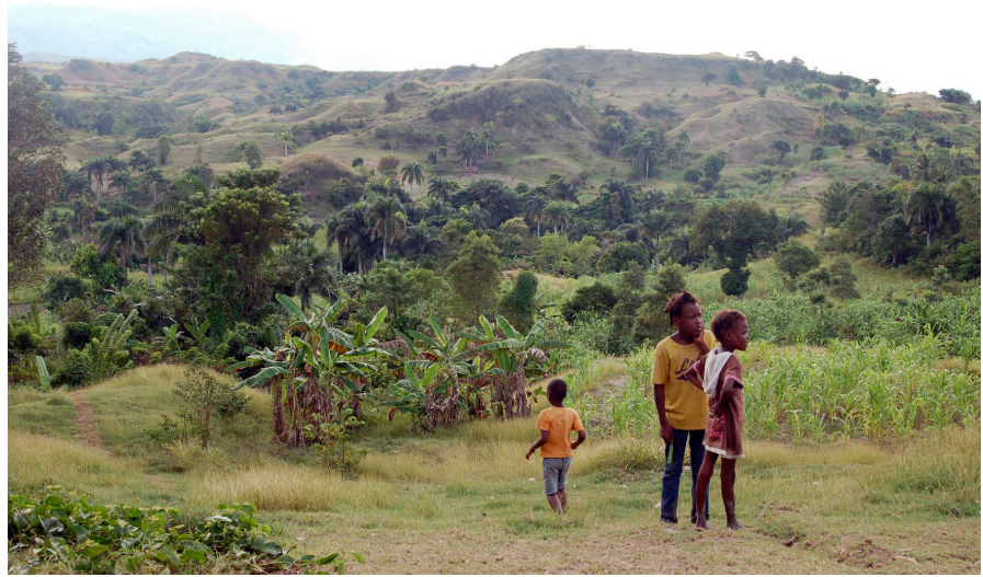
Neighbors and future students in Haiti