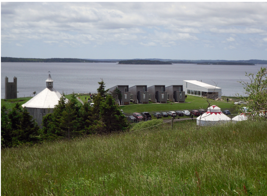
Shobac is available for rent for conferences. In this view are the barn, cottages, and conference building.

Day two included Patricia Patkau, who gave an outstanding presentation about