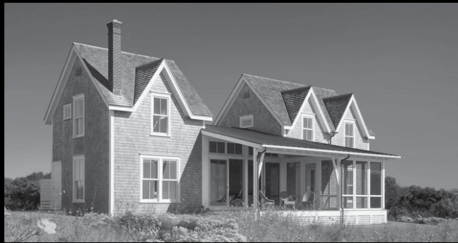
James Estes Estes/Twombly Architects Inc. Block Island, Rhode Island