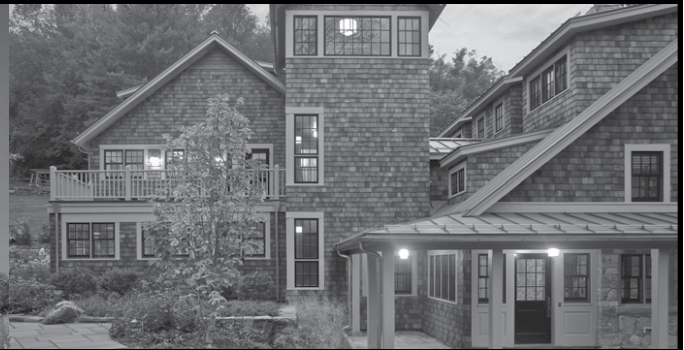
Donald Giambastiani Solomon+Bauer+Giambastiani Architects Inc. Tyngham, Massachusetts

BE INSPIRED! Visit www.marvin.com/inspired to see the gallery of winning projects.