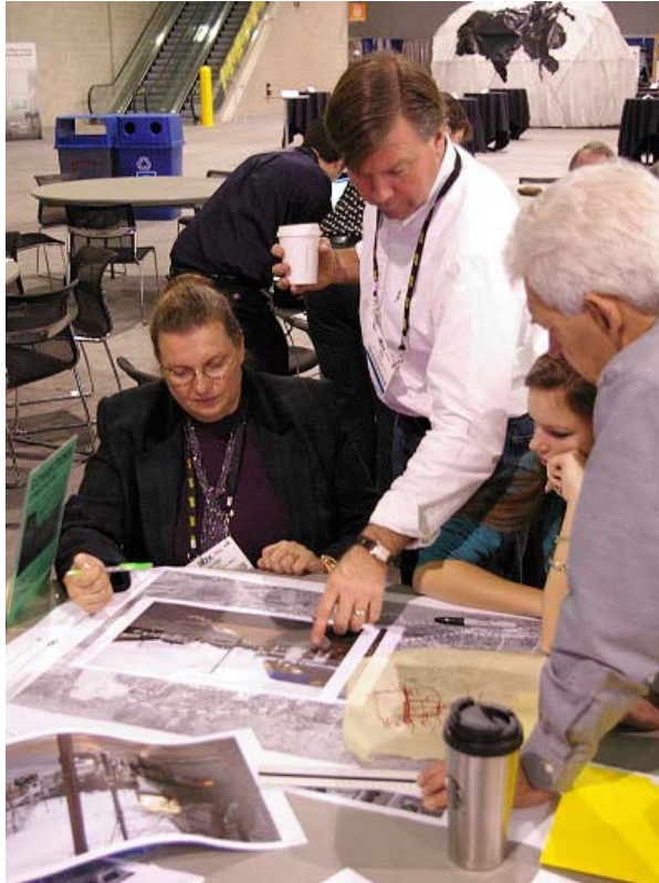
Monson charrette participants at work